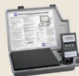
PROGRAMMABLE REFRIGERANT CHARGING SCALE