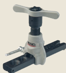
RATCHET FLARING TOOL